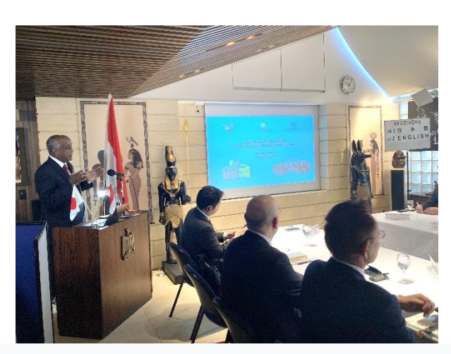
Greetings from H. E. Ambassador Extraordinary and Plenipotentiary