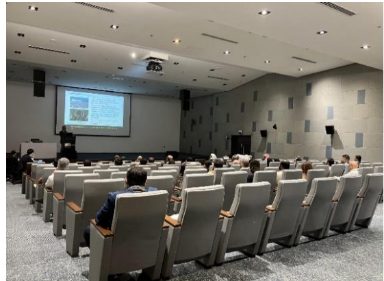
Workshop photo 2