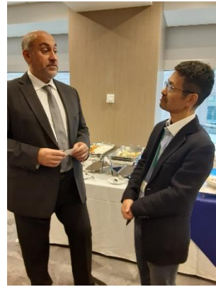
Networking Lunch - 2