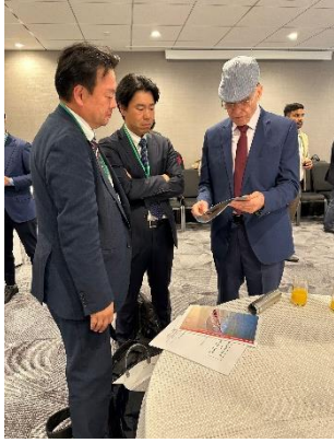
Networking Lunch - 1