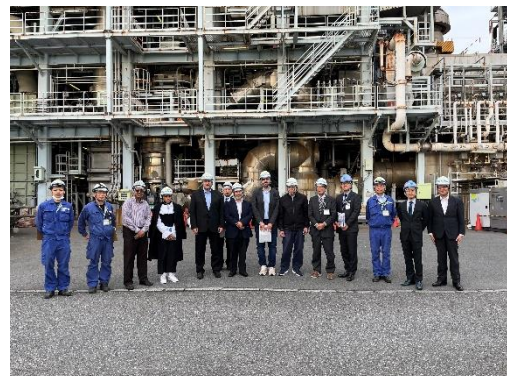
Tobu Sludge on Nov 16