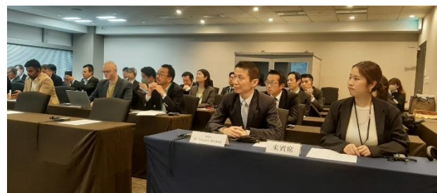
Wastewater Seminar in Japan - 2