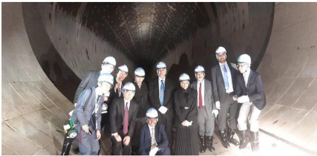
Wadayoyoi Sewer on Nov 13