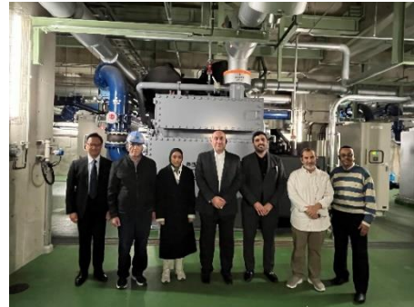
Shibaura Water Reclamation Center on Nov 14