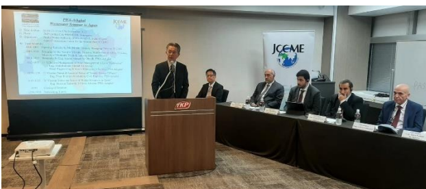
Wastewater Seminar in Japan - 1

The seminar provided information to Japanese companies on business opportunities in Qatar's sewage sector and facilitated networking opportunities. Through this series of visits, there is potential for practical business connections for Japanese companies. JCCME will continue to further strengthen its relationship with PWA-Ashghal through follow-up and effective support for these developments.