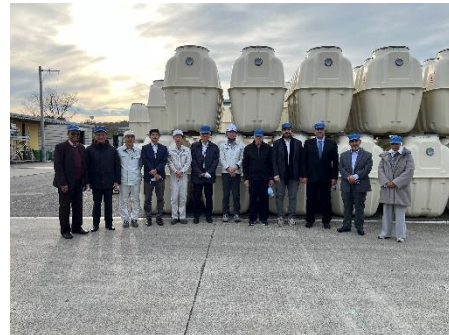
Factory of Onsite Wastewater Treatment System on Nov 15