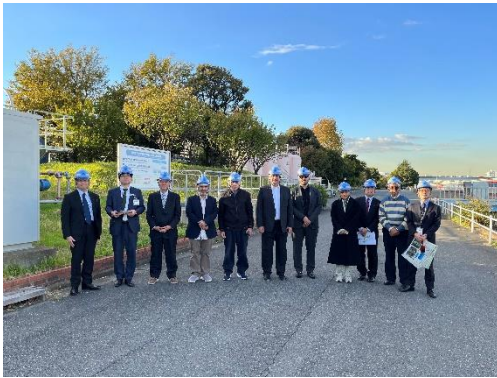
Morigasaki Water Reclamation Center on Nov 14