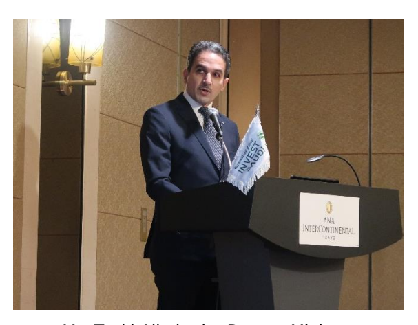
Mr. Turki Albabtain, Deputy Minister for Mining Development (MIM)